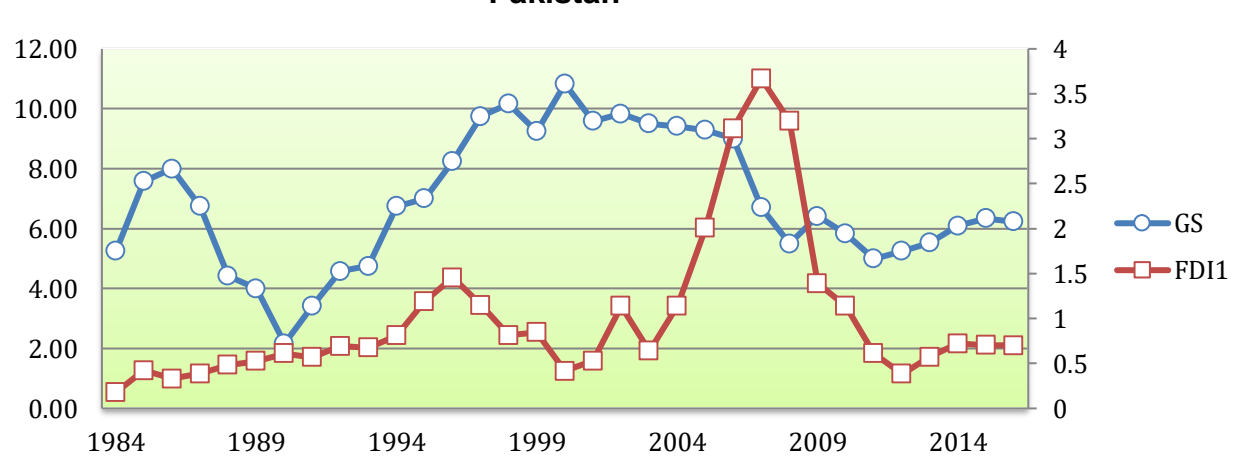
Figure 2 Foreign direct investment and government stability in Pakistan