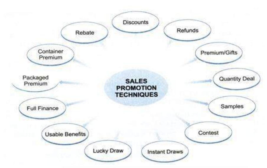
Figure 1. 1.: Promotional tools and techniques (Dubey et al., 2016)

sufficient information to underpin customers awareness of the certain product (Dubey, Saini, & Umekar, 2016).